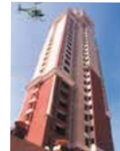
MARATHON HEIGHTS 1997