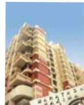
MARATHON MAXIMA 2003