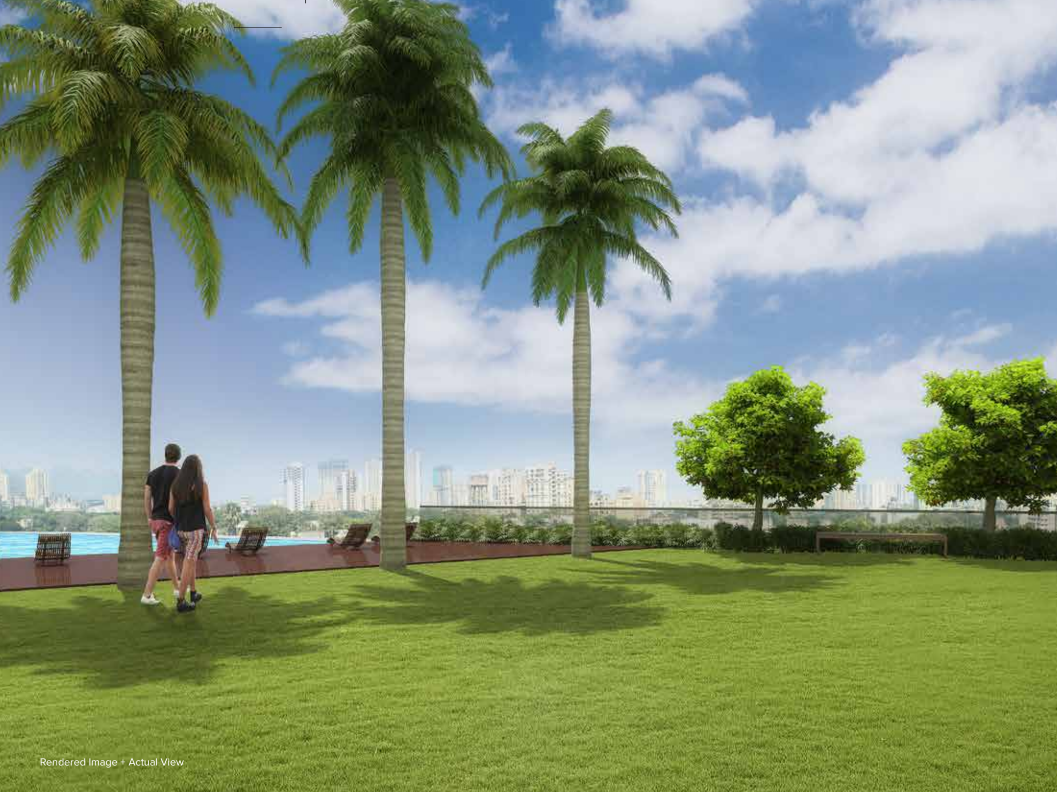
Rendered Image + Actual View

Science says green spaces are soothing to the mind and body. We agree.