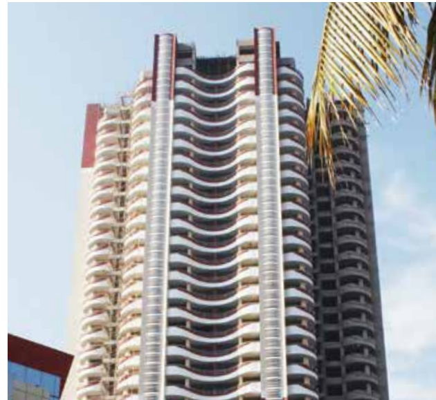
Actual Photo 2006