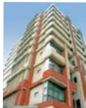
MARATHON MAX 2003