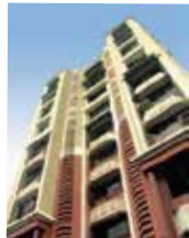
MOUNT VIEW 1996