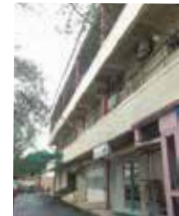
UDYOG KSHETRA 1997