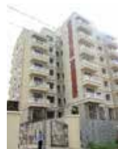
MARATHON NAGARI-NX 2014