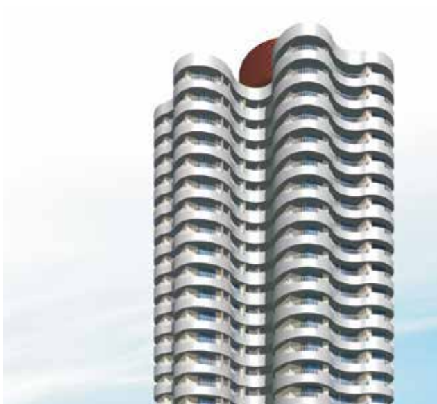
Artist's Impression 2009