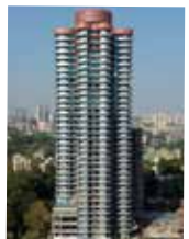
MARATHON MONTE VISTA 2013