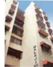
TIRUPATI & BALAJI 1982