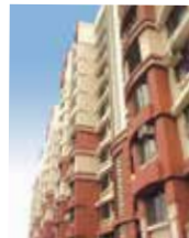
MARATHON COSMOS 2001