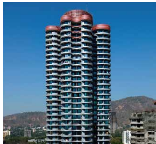
Actual Photo 2013