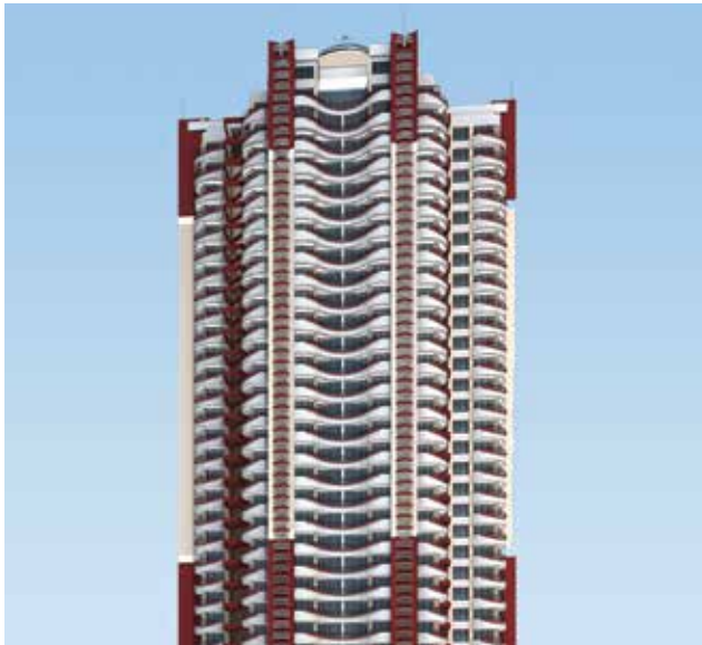
Artist's Impression 2004