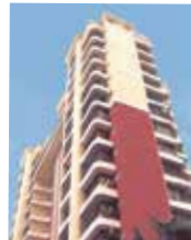
MARATHON GALAXY 1996