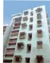
RITA APARTMENTS 1979