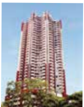
MARATHON NEXTGEN ERA 2006