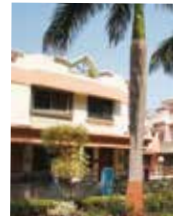
VIRAYATAN (DEOLALI) 1996