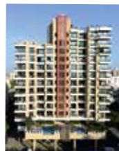
MARATHON ONYX 2012