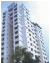
MARATHON HERITAGE 1999