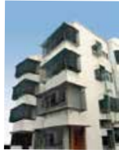
MAHAVIR DHAM 1977