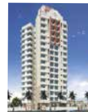
MARATHON EMBRYO 2015