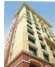
MARATHON OMEGA 2005