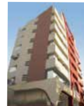
MARATHON CHAMBERS 2004